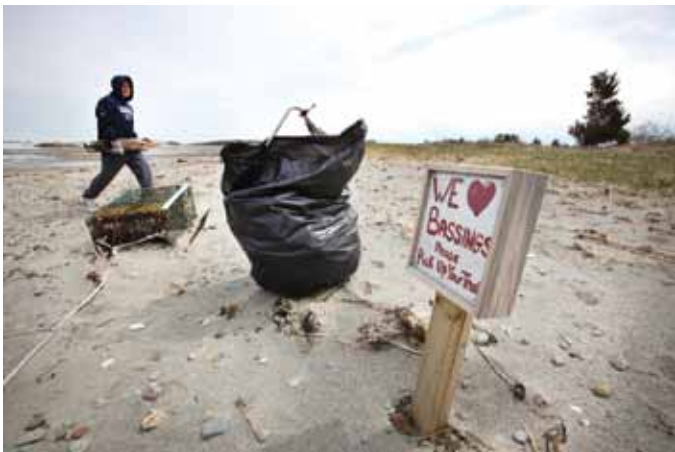
Some of last year's clean-up crew put this sign up