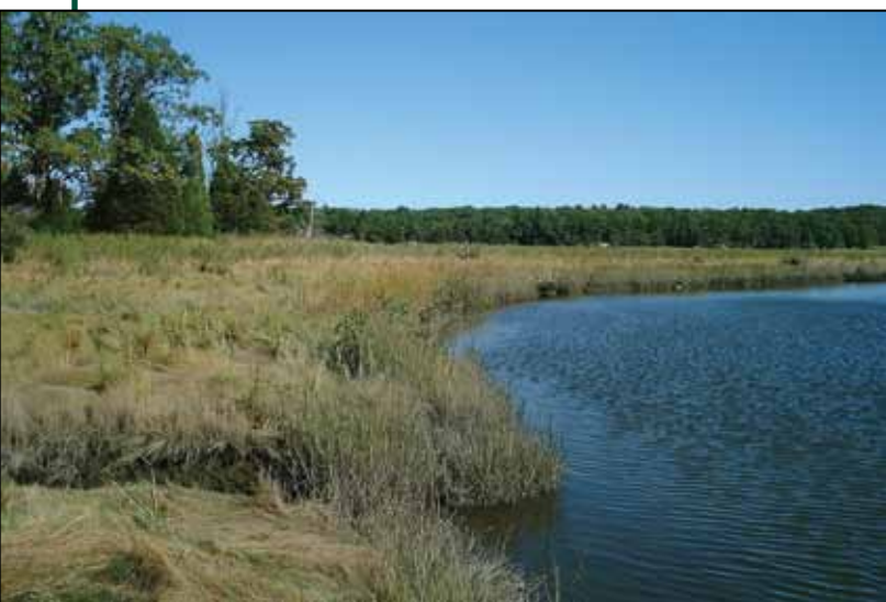
Pegram Preserve's saltmarsh and upland forest protects river frontage and provides wildlife habitat and nesting areas