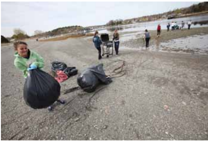
Students struggle to bring trash to the water's edge for transport to Government island

Visit our website to view a slideshow of the day's activities.