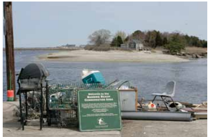
Some of the trash collected by the students