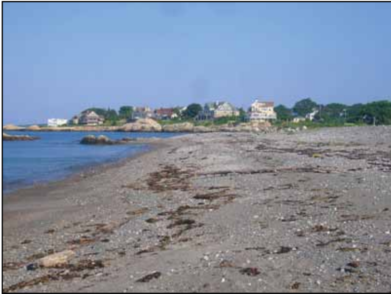
Today's view looking east toward causeway

Scott's Shore is a pristine rugged rocky beach north of Atlantic Ave. It starts at the beginning of the causeway as you head west on Atlantic Ave from Sandy Beach and continues for 1000 feet.